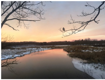
Heard Pond in Winter