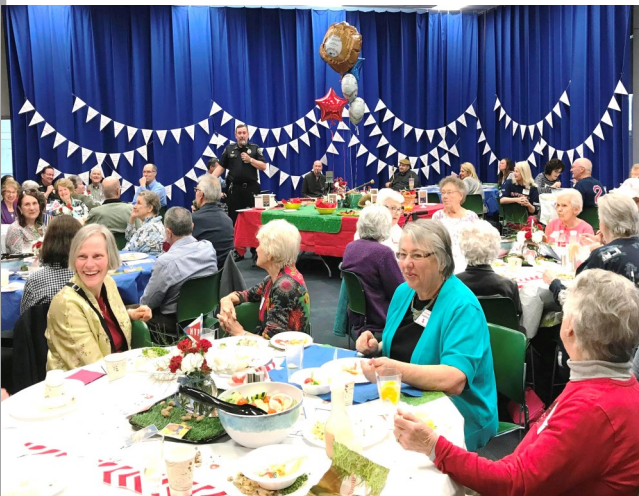
Volunteers enjoy lunch and laughs at our annual event.