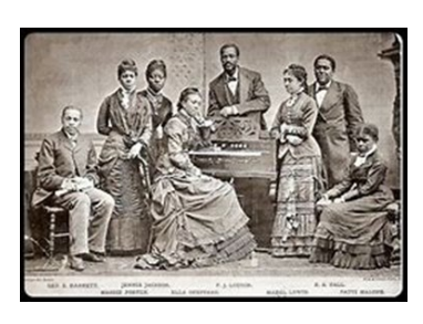
Fisk Jubilee Singers

This travelogue along the road to freedom begins in the days of the Underground Railroad with the spirituals of the enslaved and the abolitionist protest songs. After the Civil War two other important players in this story are featured: the Fisk Jubilee Sing-