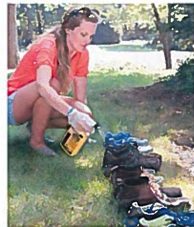
Treating your shoes with permethrin repellent is TickSmart and should be done every month throughout the spring and summer.

United States Environmental Protection Agency. 2006. Permethrin Facts. http://www.epa.gov/oppsrrd1/REDS/factsheets/permethrin_fs.htm